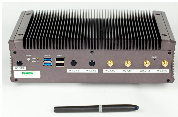
Larger Images: front back

TCP-DL-30sta-open wave-1 3x3 | TCP-DL-30sta-wpa2 wave-1 3x3